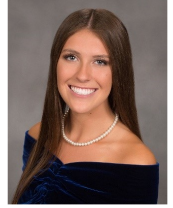
Isabel Price Lamar School