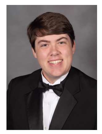
Benjamin Sills Lamar School