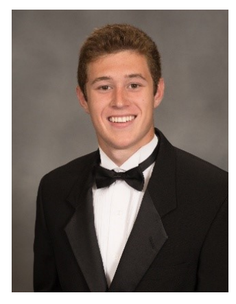
Hayden Farrar Lamar School